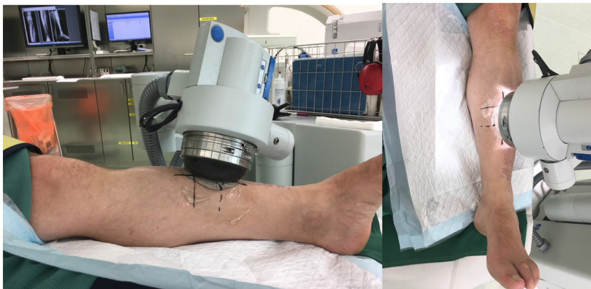
Fig. 1. Typical shockwave application of a tibial non-union under general anesthesia in the trauma center Vienna, Meidling. The non-union is located by x-ray fluoroscopy and marked on the skin. Bubble-free conduction gel is applied and the focus of the therapy head is adjusted to the fracture gap. Thereafter, electrohydraulic impulses are applied from different directions.

coarchitecture following a fibula osteotomy. A single application of 2000 pulses with an energy flux density of 0.16 \text{ mJ/mm}^2 resulted in significantly higher trabecular bone volume fractions of the proximal tibia compared to the untreated contralateral side, which also persisted for up to 7 weeks after treatment. However, healing of the fibula osteotomy was not affected [51]. Single photon emission computed tomography (SPECT) analysis of healthy tibia revealed increased uptake of technetium-labeled methylene diphosphonate in response to a single shock wave application, suggesting increased metabolic activity of osteoblasts. In addition, structural analysis performed by micro-CT imaging revealed both increased trabecular and cortical volume [52], resulting in improved biomechanical properties in osteoporotic bone [53].